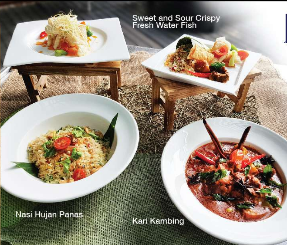
Sweet and Sour Crispy Fresh Water Fish

RM8.50nett per slice | RM60.00nett whole cake (1/2kg)